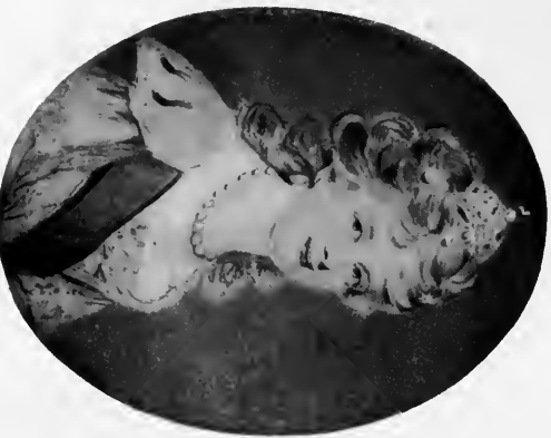
Empress Maria Louisa